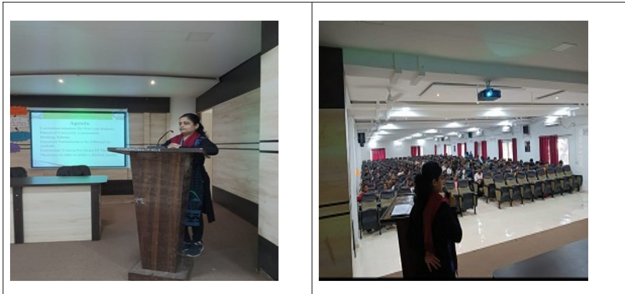
Workshop on FE syllabus and Structure.